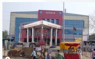
RTC Complex Patancheru

' GLOBAL GATE ' is situated at Nandigama Village on BDL Bhanur Road, Patancheru Mandal. It is very near to Outer Ring Road, Surrounded by Educational Institutions and Residential Townships.