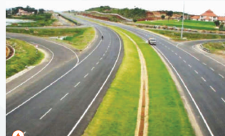
Outer Ring Road (ORR)